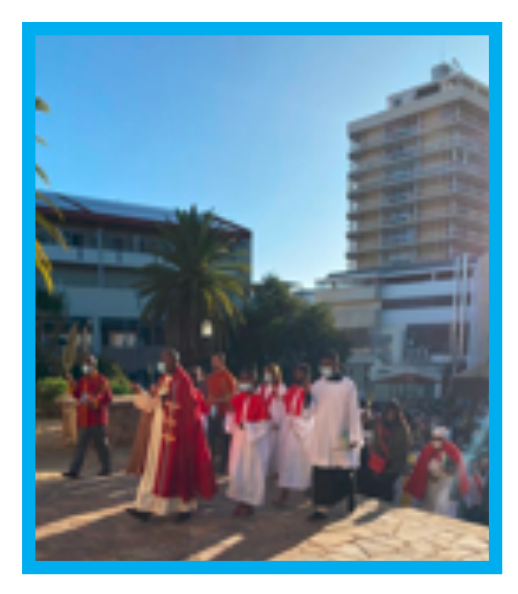
Palm Sunday procession