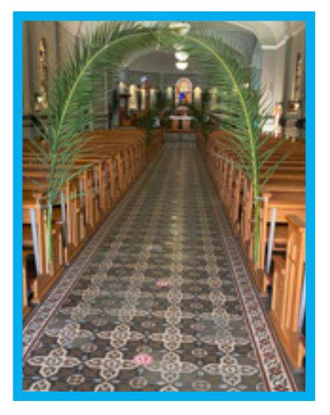
Decoration of the church for Palm Sunday