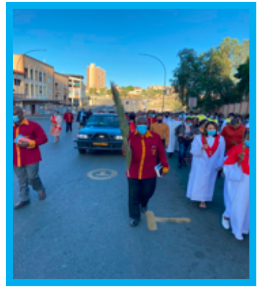
Palm Sunday precession. While the Men's group is keeping the order