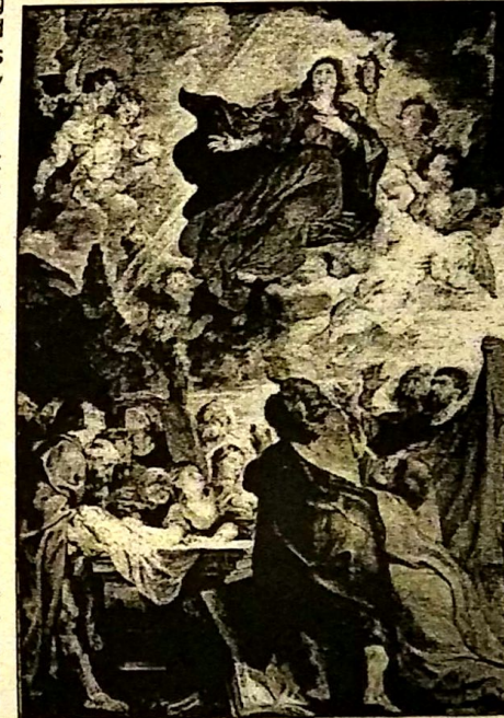
The Assumption of the Virgin Mary. Peter Paul Rubens 1616-1618

John Banister Tabb (1845-1904) was an American Catholic priest and poet who evoked the beautiful relationship between Mary (the mother bird) and the Son (the fledgeling) in his poem, "The Assumption": Behold! The mother bird The fledgeling's voice hath heard! He calls anew, "It was thy breast That warmed the nest From when I flew. Upon a loftier tree Of life I wait for thee;