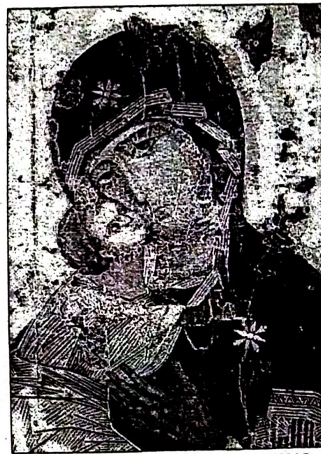
Beloved Icon of Our Lady of Vladimir, 1131 AD, tempera on wood. Hall Museum Church of St Nicholas, Moscow. Artist unknown.

Purer art thou than are all heavenly hosts angelical who delight with pomp and state on thy beautiful Child to wait. Mary's virginity stands as a vivid statement of the origin of Jesus. Taking his humanity from his mother, his real origin is in the Godhead: Son of God, "begotten not made, one in being with the Father". As a virgin, Mary is total receptivity, ready and willing to co-operate with God's plan. As a mother she gives the Incarnate Word a human face. In this, fulfilling God's plan of salvation, she becomes a spiritual mother to all of humanity.