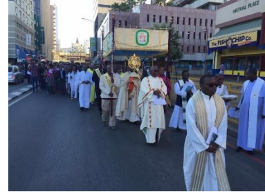
Corpus Christi Mass and Procession

For the service and repair of the pipe organ, a deposit of N$31 185-00 was paid. With the COVID-19 restrictions, the whole process of coming to repair the organ by the newly established Pipe Organ Specialists was postponed. Frequent communications between the office administrator in Pretoria and the St Mary's parish office took place.