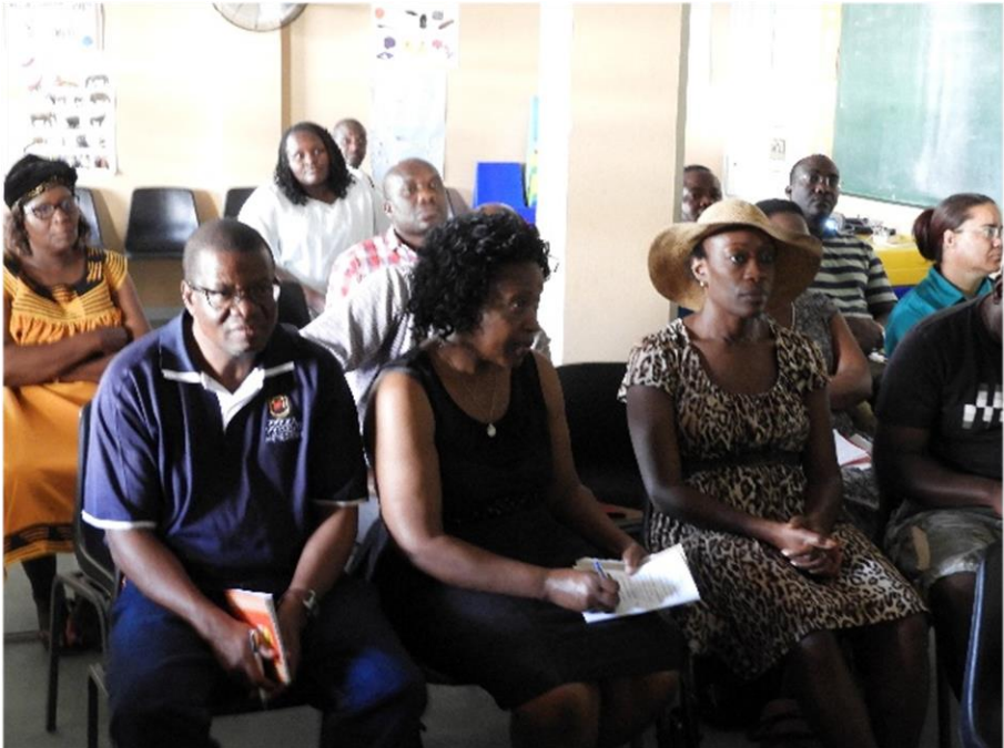
Participants at the Parenting Workshop (September 2019)