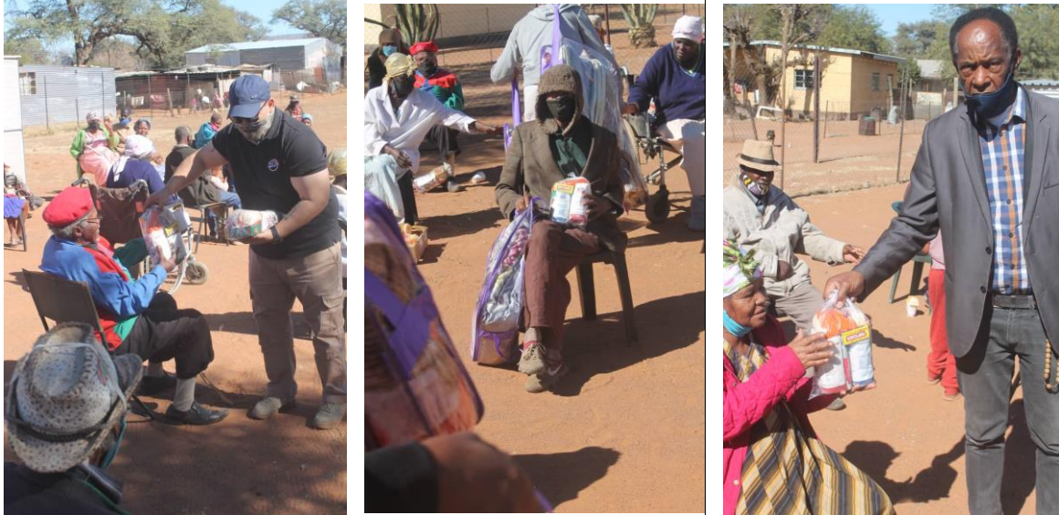
Food parcels and blankets donated to the residents of Dordabis