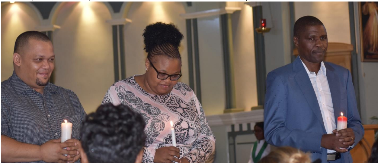
Blessing of Catechists