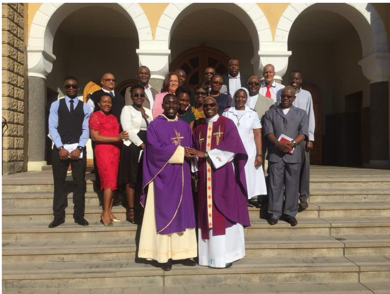
The newly installed PPC