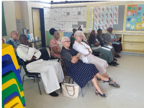
Participants at the Elders meeting, September 2019

Parish Community Life Committee, in line with its mandate to build the Parish into a faith community, responds to the needs of the diverse groups of the parishioners, namely children, the youth, adults and senior citizens. It identifies and carries out activities aimed at