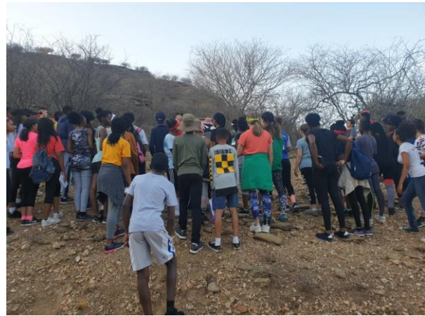
Retreat for Confirmation candidates

The confession and rehearsal as part of preparation is held Fridays from 14h30, before the Confirmation day.