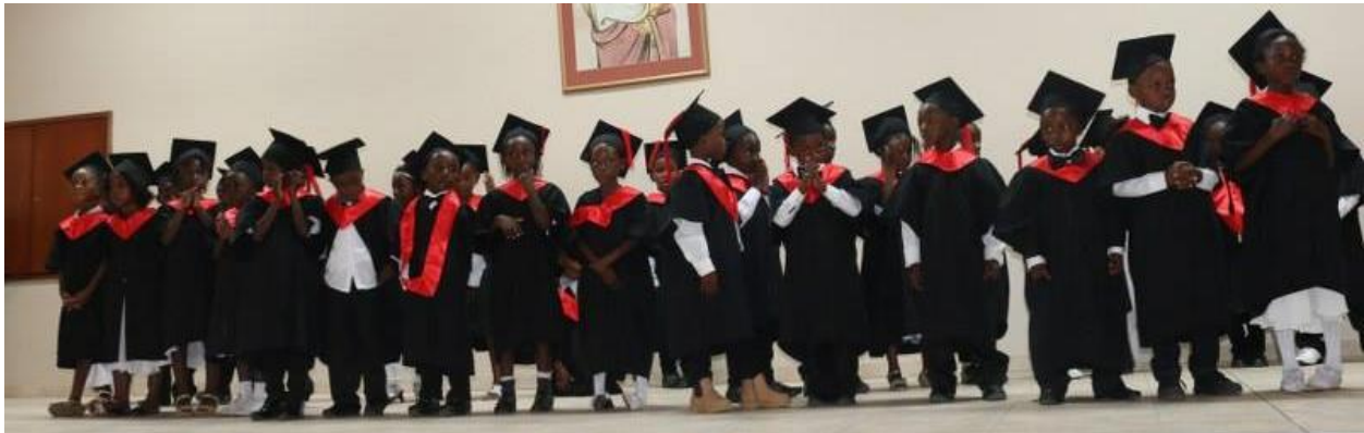
Kindergarten graduation ceremony