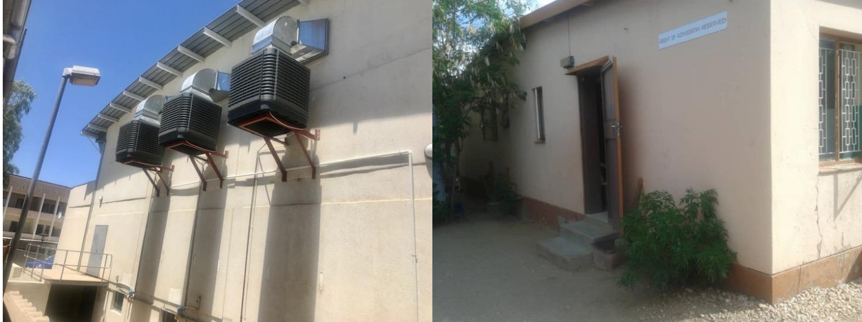
New coolers on Parish Hall

Four new water coolers were installed at the Parish Hall to replace the old ones, which experienced mechanical problems. There is still insufficient power output to the Hall and Church area and continued power outages are being encountered. A solution will be attended to in due course.