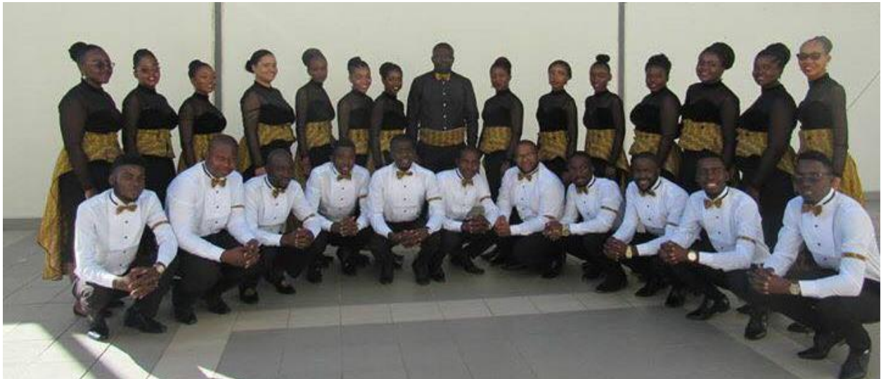
Senior Youth Choir

The aims and objectives of the Youth Committee are to: