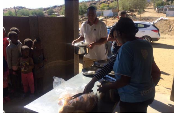
Outreach to Havana Informal Settlement