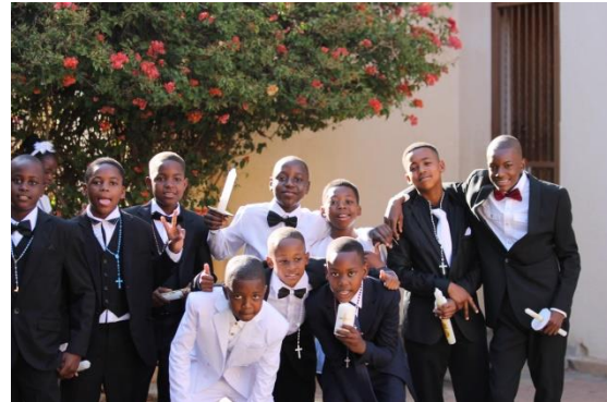
First Holy Communion candidates

The Confirmation annual retreat (only second year candidates) is conducted annually and the dates for the period under review were as follows: